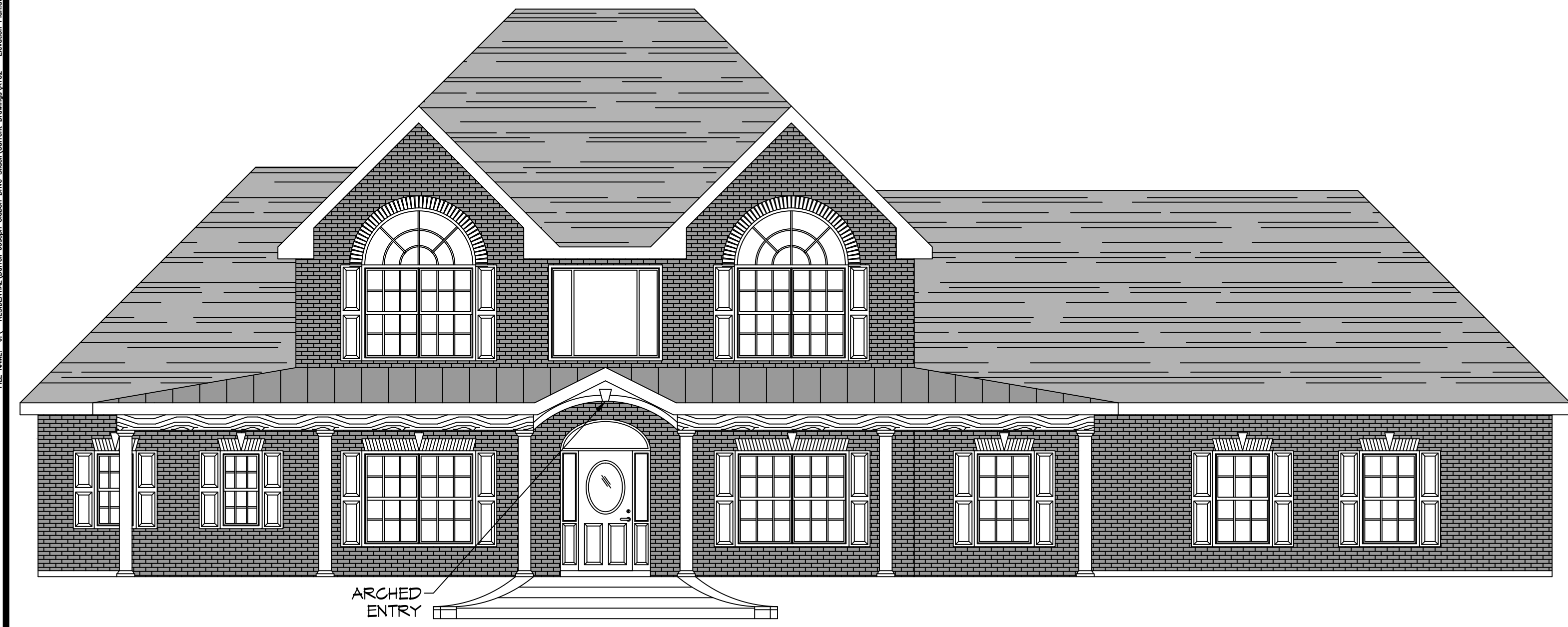
12 FRONT ELEVATION PLAN SCALE: 3/16" = 1'-0"