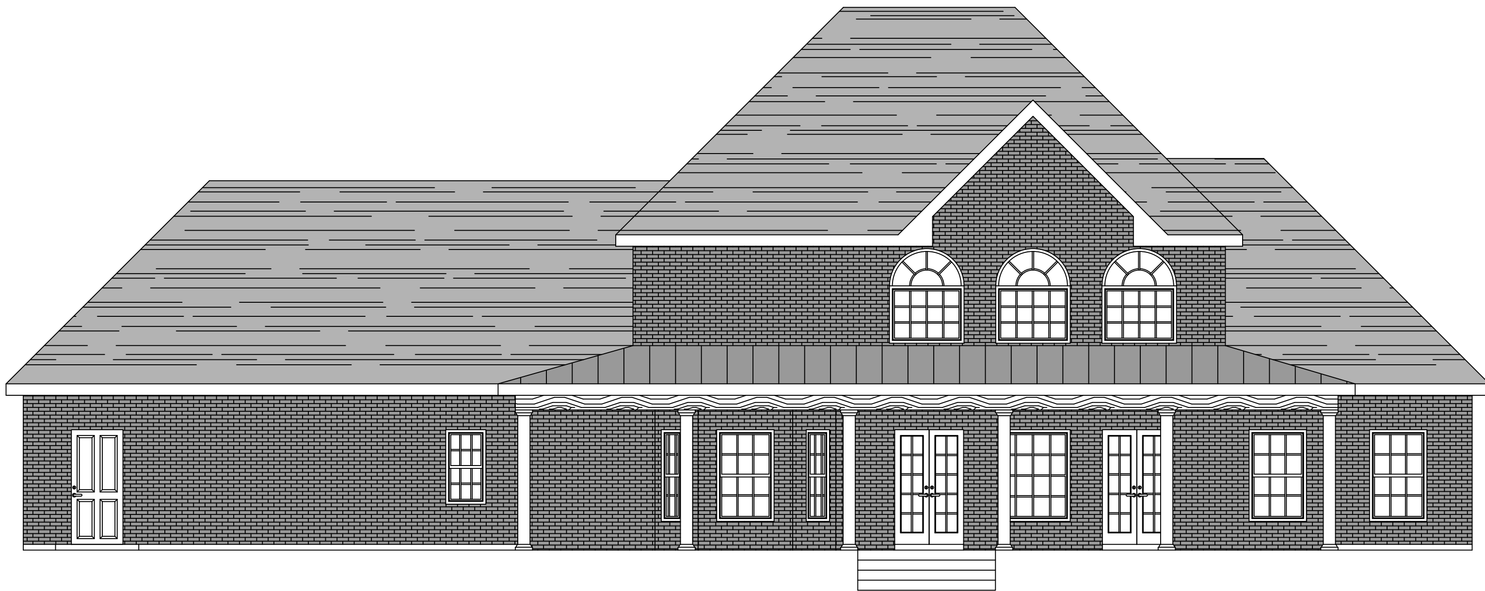
14 REAR ELEVATION PLAN SCALE: 3/16" = 1'-0"