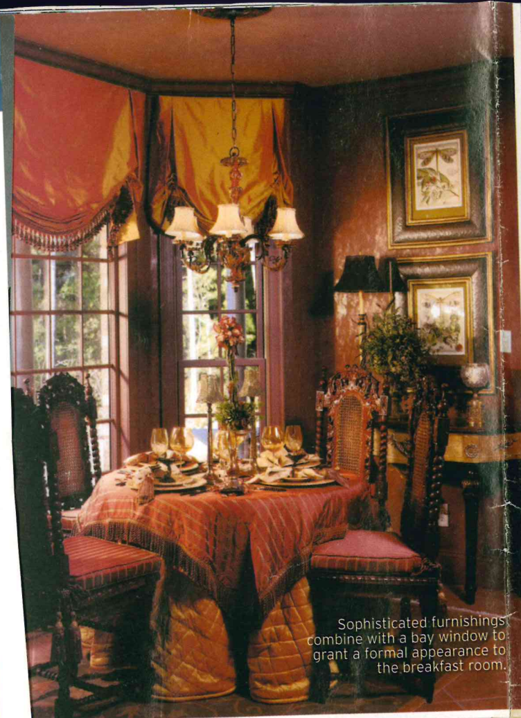
Sophisticated furnishings combine with a bay window to grant a formal appearance to the breakfast room.