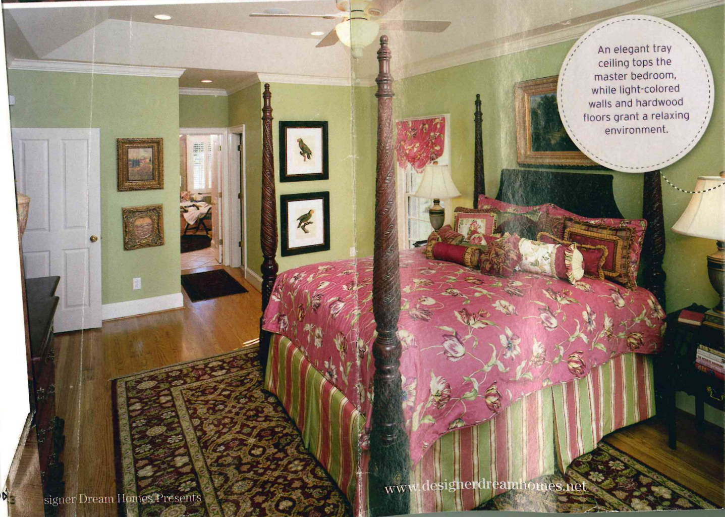
An elegant tray ceiling tops the master bedroom, while light-colored walls and hardwood floors grant a relaxing environment.