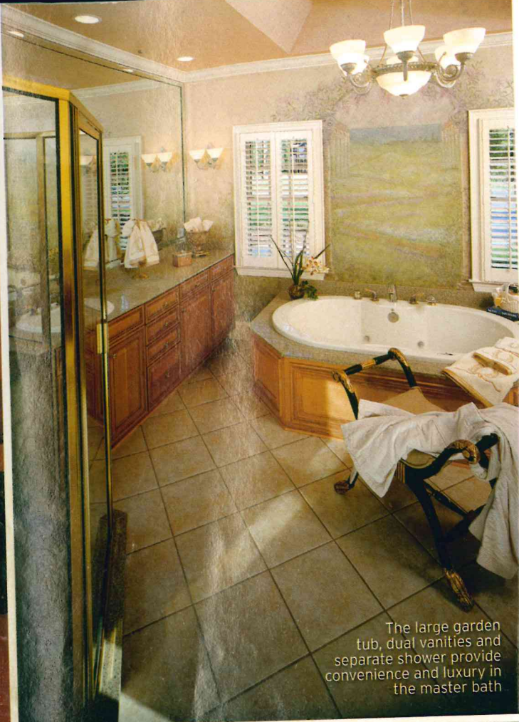
The large garden tub, dual vanities and separate shower provide convenience and luxury in the master bath.