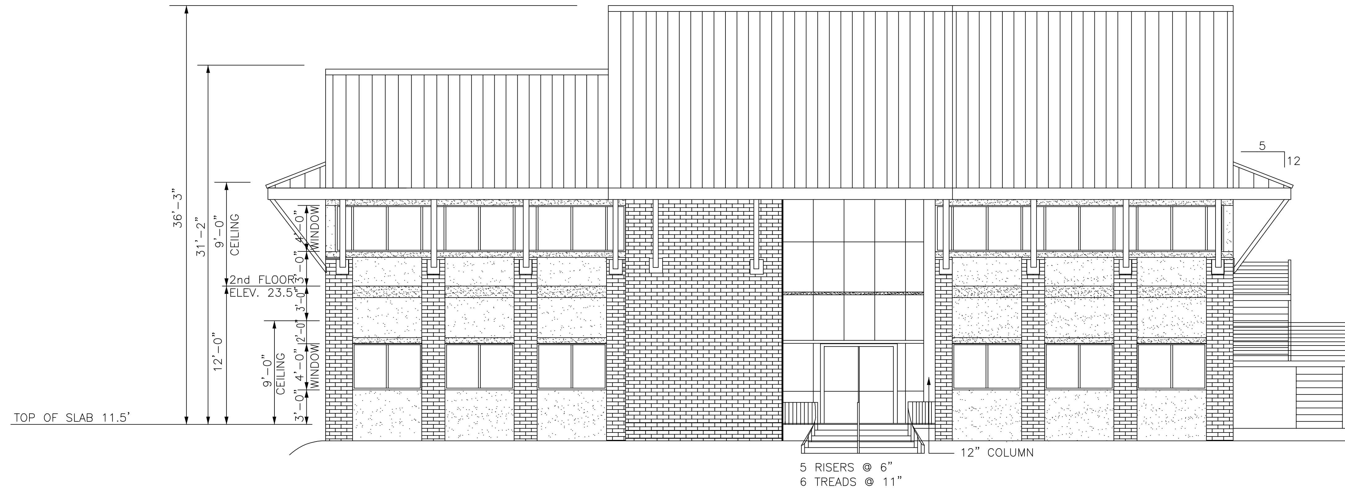
FRONT ELEVATION SCALE: 3/16"=1'-0"