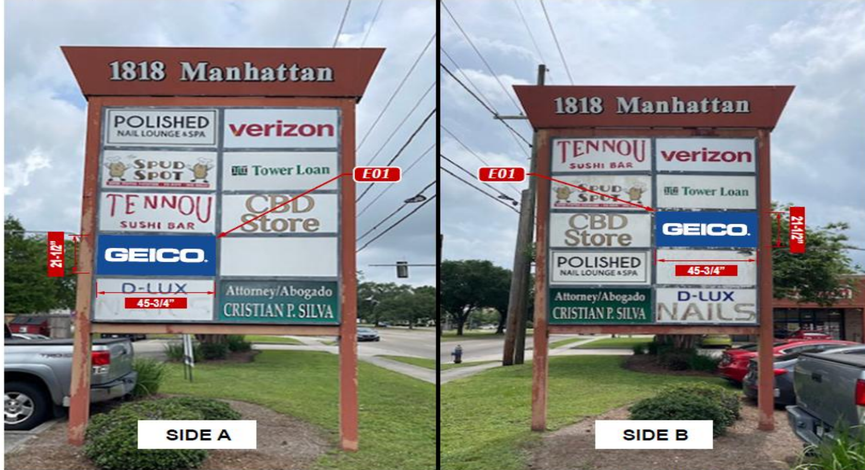
Signs Rendered Proportional to the Photo