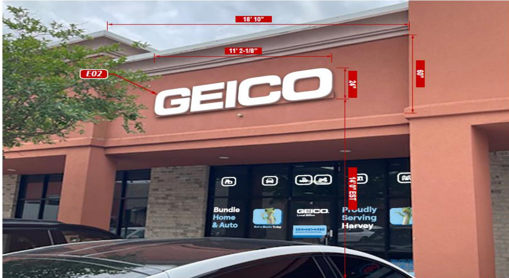
Signs Rendered Proportional to the Photo