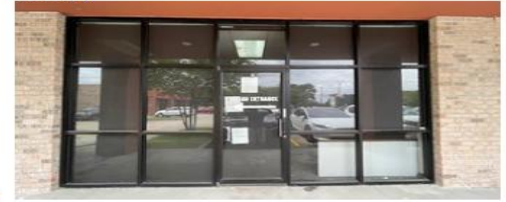
Signs Rendered Proportional to the Photo