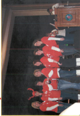
2010 Winner NAWIC: MS Gulf coast Chap- ter#256

The present YATs program invites youth ages four to eighteen to experience live theatre as performers, crew, and technical technicians. There are over two hundred youth participating in our summer program. Unfortunately the program is limited by our facilities. So we have started this fundraising campaign to help grow the facilities and programs. We hope with your support, to further our educational programs for all ages.