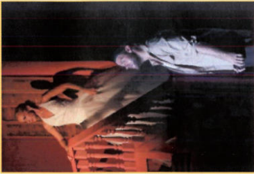
SLT's Production of EVITA