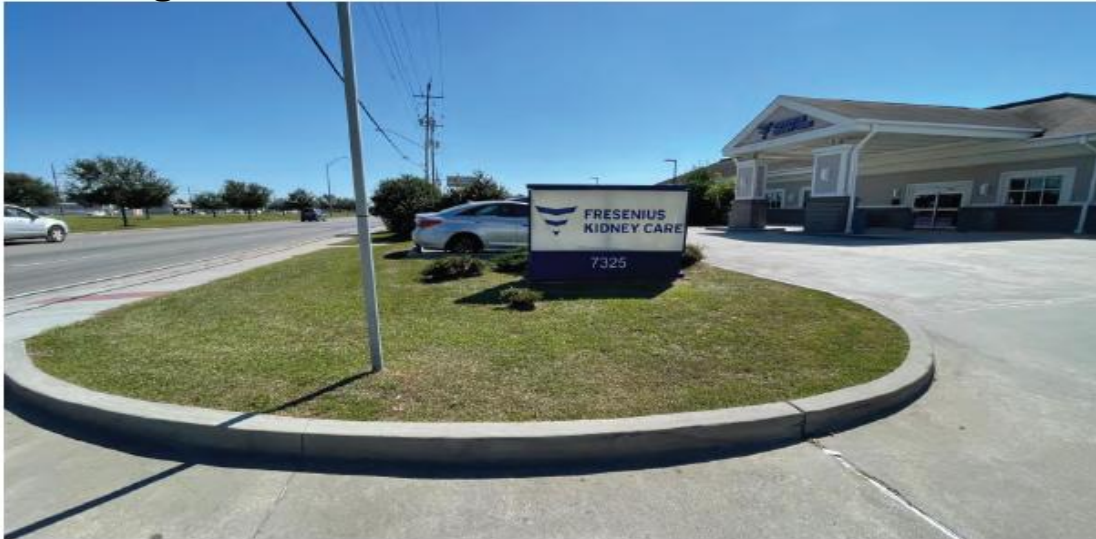
EXISTING MONUMENT SIGN TO BE REMOVED 42.43 Square feet