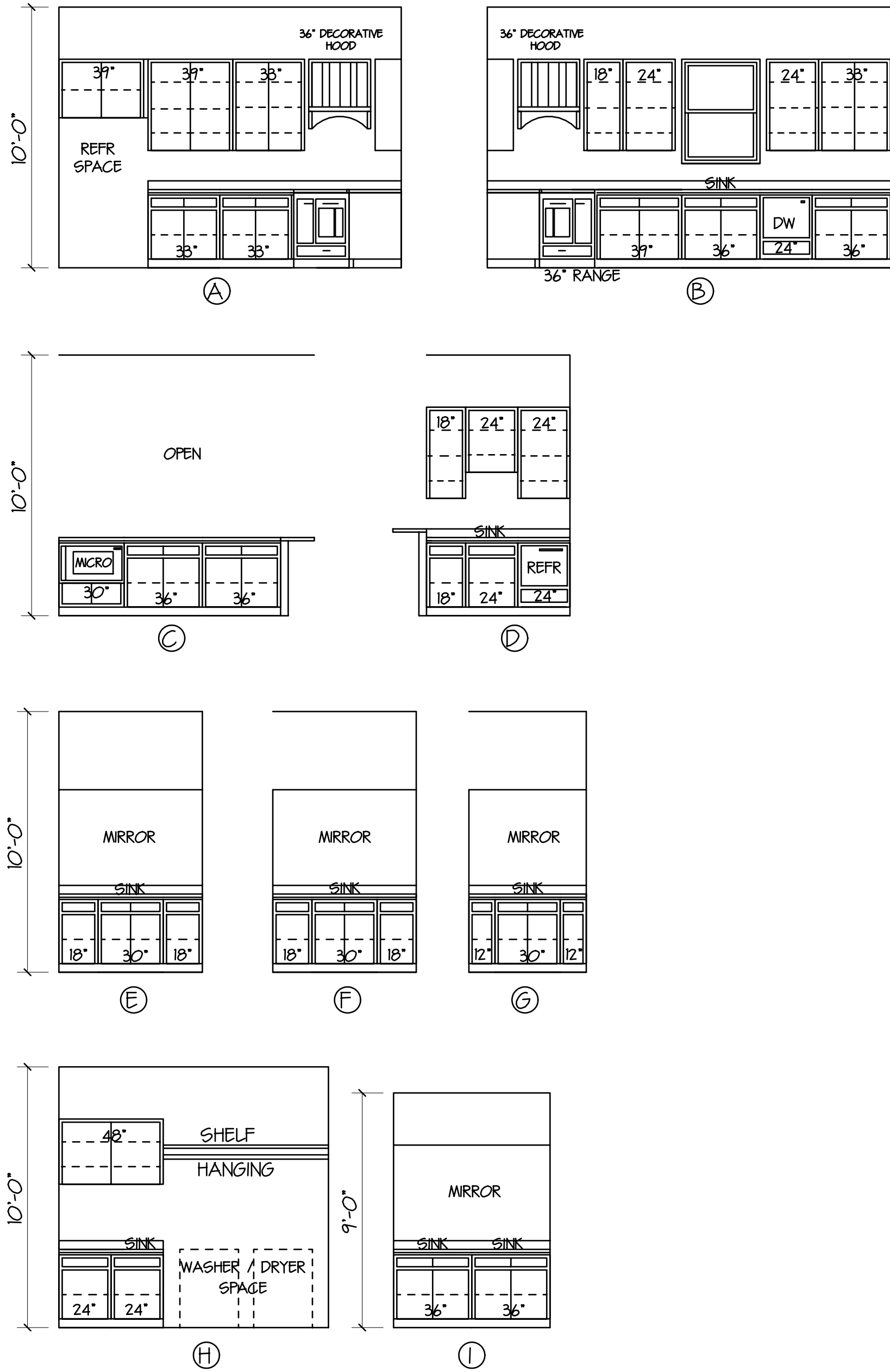
CABINET ELEVATIONS SCALE 1/4"=1'-0"

** SEE FRAMING PLANS BY ENGINEER FOR LUMBER SIZES AND DIRECTION **