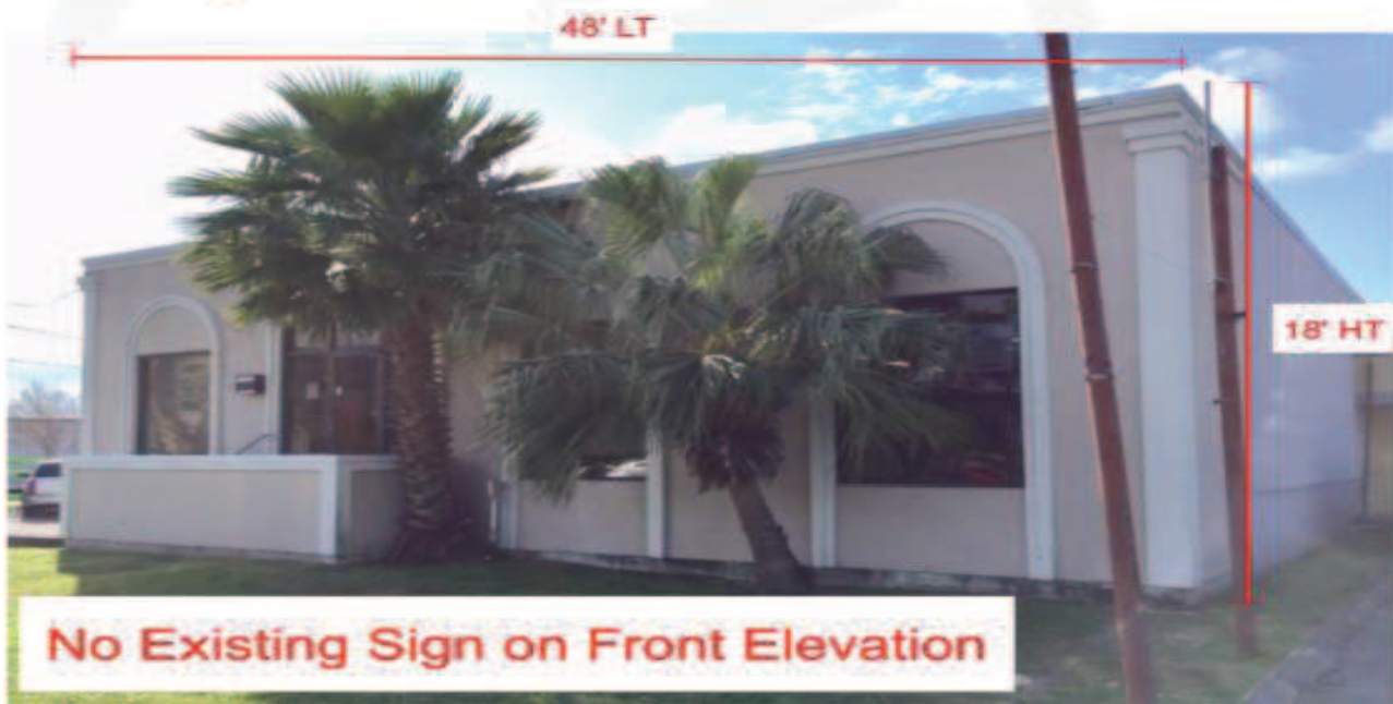
Building Front - Williams Blvd. Elevation