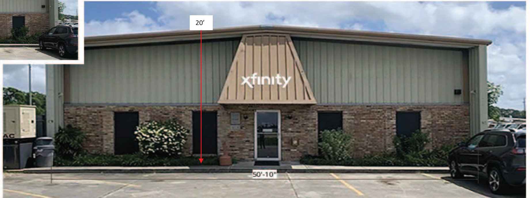
STOREFRONT ELEVATION - PROPOSED (1.0 ABOVE/1.1 BELOW)